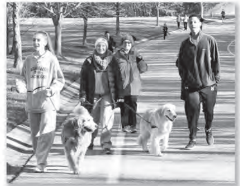
Neighbors of Eagles Passages come out to help Rude Ranch.

Some families celebrate Thanksgiving by watching parades, or playing football before the big meal. The neighborhood of Eagles Passages celebrated the past Thanksgiving by holding a Turkey Trot fund raiser to benefit Rude Ranch Animal Rescue. Lots of families braved the cold with their dogs (most of the cats did decide to sleep in on this one) to walk/jog or run the 5k through the neighborhood. The first place runners were rewarded with trophies and first pick of the snacks and treats, including Coldstone Creamery Ice Cream!