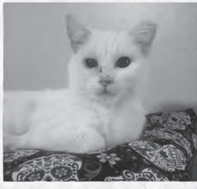
Andromeda suffered severe injuries on the farm.

Although this agreement was working, the farmer didn't want any more cats on the farm and contacted Tip Me Frederick for help to spay, neuter and vaccinate the cats currently living there. Volunteers from Tip Me arrived to help round up the cats and prepare them for transport to the Spay Spa & Neuter Nook. A little white kitty, Andromeda was one of the cats that was rounded up for the trip.