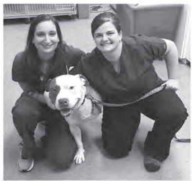
Rallo after surgery at the Spay Spa & Neuter Nook